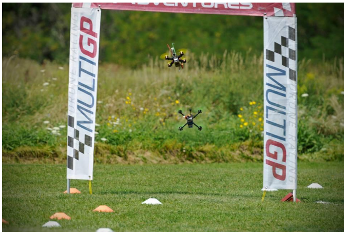
The starting gate set up for drone racing.