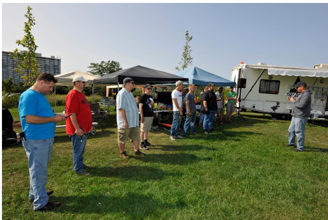
Spectators line up near mobile home command center.