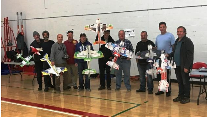
A great turnout for indoor flying on November 11th.