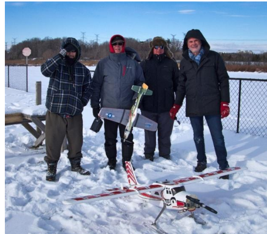
Here is the traditional line up for a photo-op.