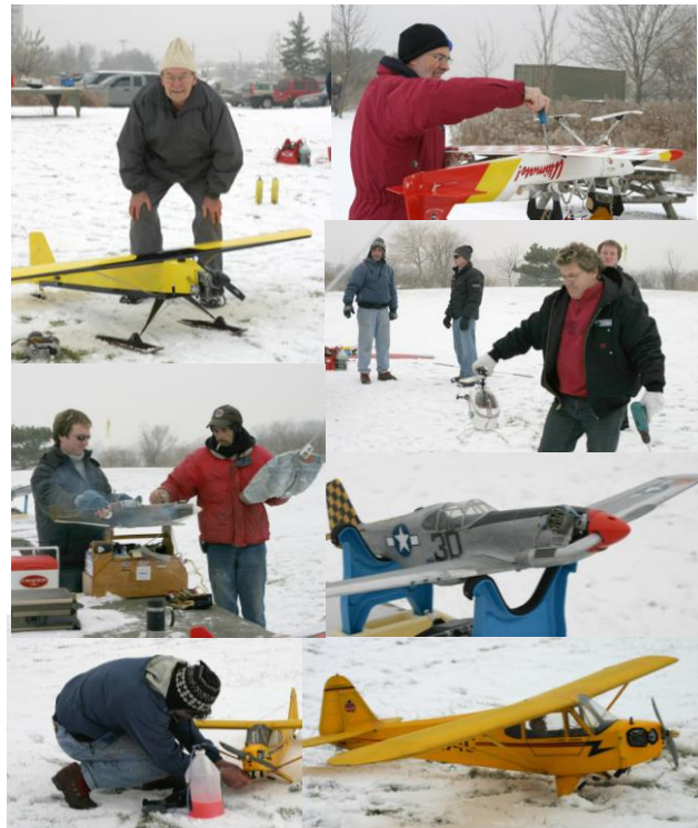
Blast from the Past! A Collage of Pics from 2006 FFFFFFF!

ground at the field. So bring out your skis or floats and come out for a winter blast. Hot Chocolate will be served.