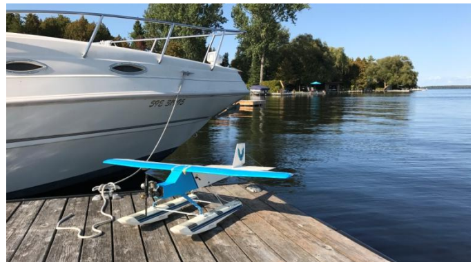
Tom has resurrected Pat Knight's 40 year old float plane. Come see it fly on Aug 11 th