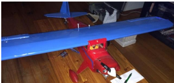
The mystery ship looks like a small Cub