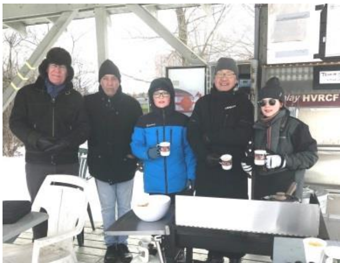
Hot chocolate warmed everyone up at the FFFFF.