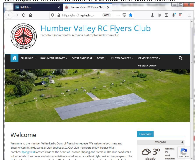
Our new web site home page under development

put a lot of hours into this project and the new site will be a great asset to the club. Besides making information easier to find and update, the new site will save us time and is sure to attract new members. And it uses up-to-date technology that is compatible with current browsers, smart phones and tablets. We hope to be able to launch the new web site in March.