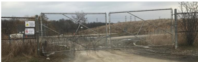
Thackeray Park gate is closed to flying until further notice.

application which would have taken affect on May 1 st but with all City offices closed due to the virus, I would not be surprised if there is a delay in processing our permit. We will keep you posted on any developments.