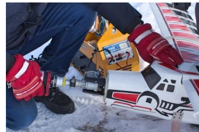
Why won't it start? It's only -20°C!