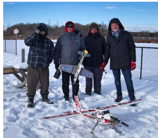
Here is the traditional line up for a photo-op.