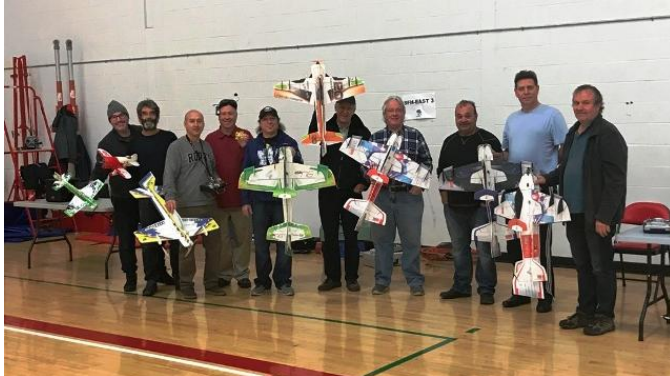
A great turnout for indoor flying on November 11th.