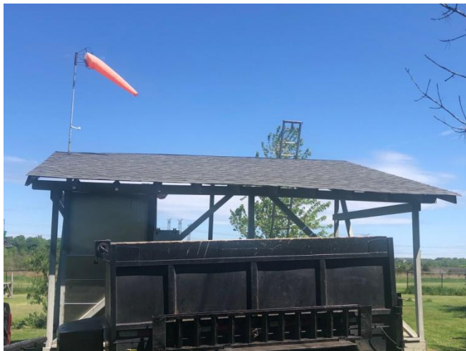
New roof shingles installed!

Next on the list will be improved heavy gauge wiring and upgrade of the charging station to support 24 volts for larger battery packs. We will keep you posted on these developments as they happen. Isn't our new roof a thing of beauty?