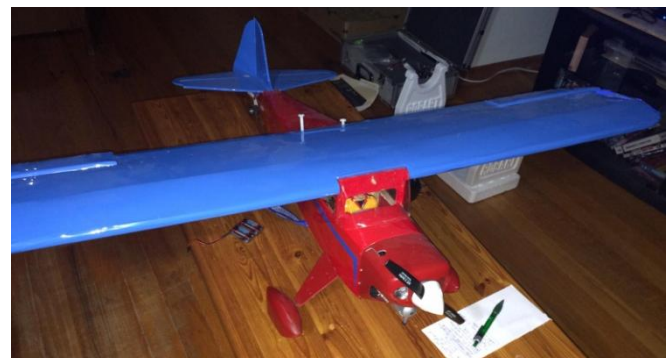
This mystery ship to be raffled off at the Feb 5 th meeting.

The fun never stops at Humber Valley. We have a nicely built finished airplane with a 56" wingspan and small glow engine. It looks something like a Cub and should be a nice gentle flyer. It can be yours if you come to the Feb 5 th AGM meeting. We will be raffling it off for FREE to any paid up member who wants to put their name in for the draw. With only a little TLC you can get it flying or convert to electric. Just add your own receiver and battery and go flying. Good Luck!