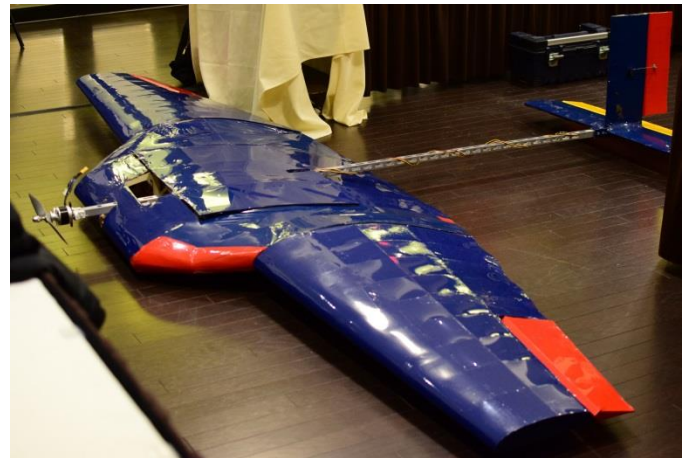
Ryerson's massive RadicalOne airplane.

program. So if you see something blue and HUGE at the field this summer that looks unlike any airplane you have ever seen before – it is probably them!