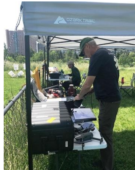
Visual observers and ground crew manage the equipment and flight operations.