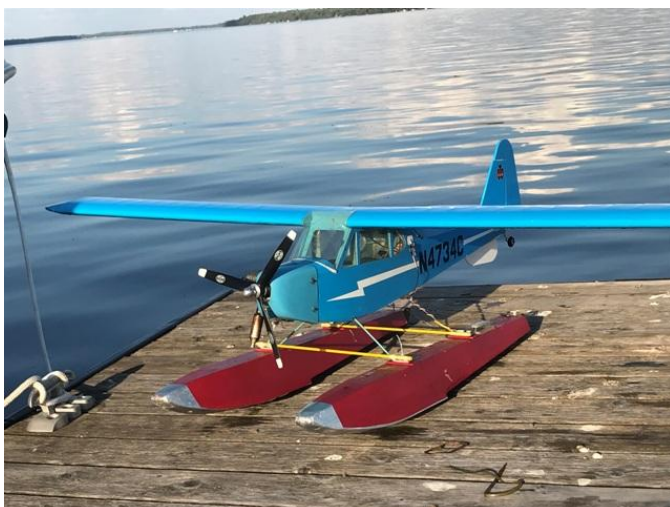
Tom's new (old) J3 Cub looks good in calm water.

Directions: See the detailed steps on the following page.