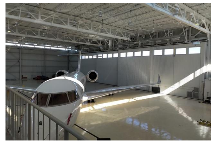
Nice looking private jet! This gives you a sense of the size of the space when it is occupied!