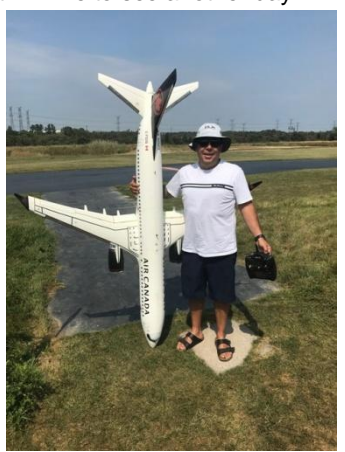
Thanks to everyone who participated and helped make it a successful day.