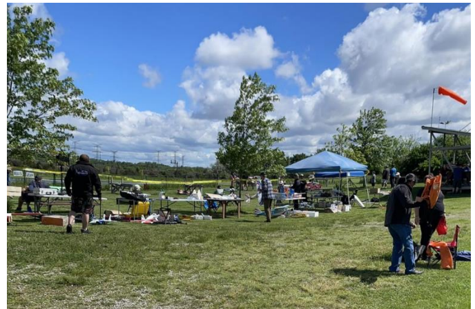
Lots of vendor tables and bargains to be had...