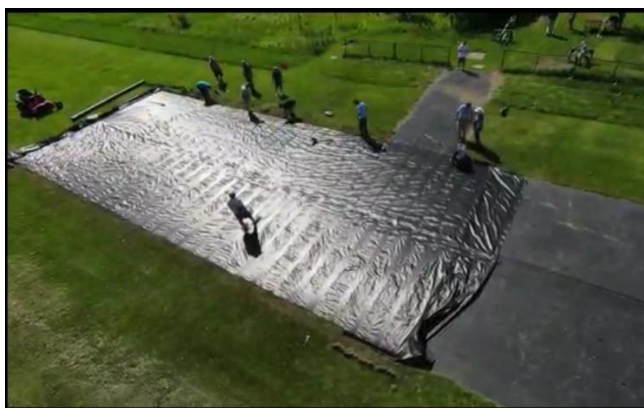
Drone shot of the east runway extension being installed.

Then on May 24 th , our crew of volunteers sprang into action again for the much bigger task of extending the runway by another 150 feet. This now makes it much easier for ducted fan jets, and light foamies to take off and land successfully at Humber Valley. Our members have really been enjoying these improvements.