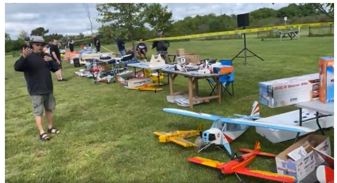
Joe invites pilots to view the large selection of sale items.