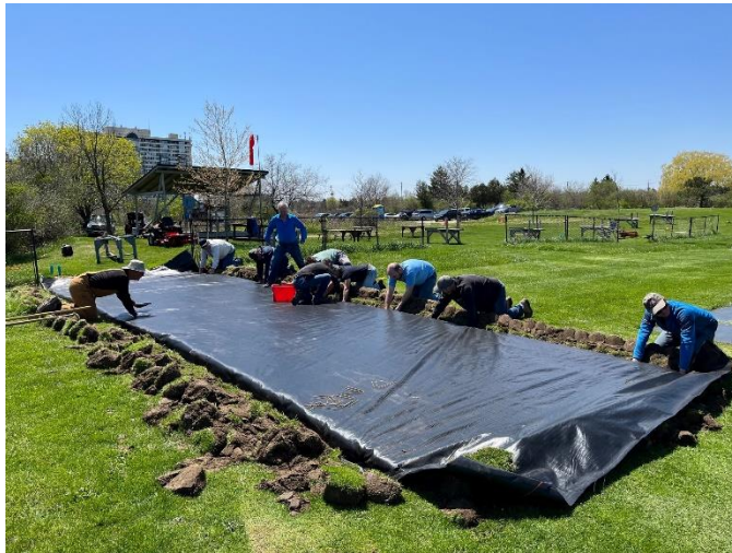
Volunteers work on laying down the Geotextile taxiway.

On May 7 th a second taxiway was installed on the east side of the field in preparation for a 150-foot runway extension that was being planned in the coming weeks.