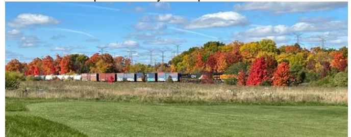
It doesn't get any nicer than this!

Take advantage of the last good days of fall and enjoy a spectacular display of fall colours at the field. Weather conditions were perfect this year to produce vibrant colours.