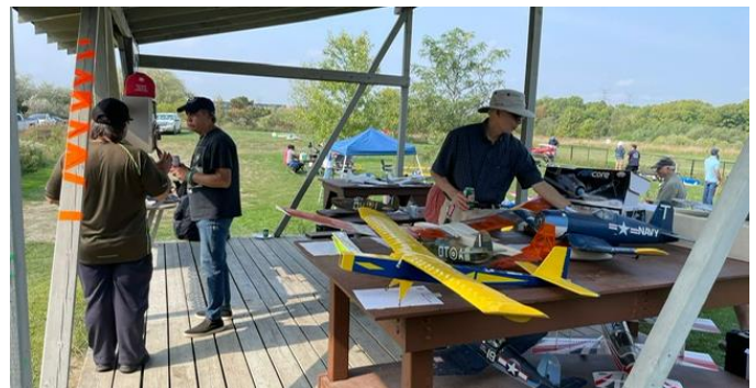
Lots of free stuff was raffled off at our Fall Fun Fly & BBQ