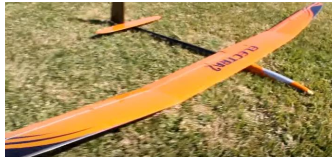
It's hard to appreciate how big 3.5M is from this photo.