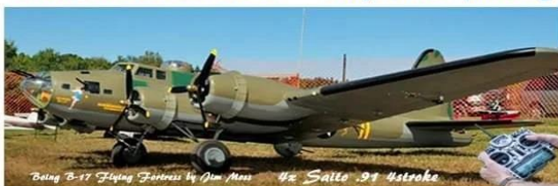
Boeing B-17 Flying Fortress by Jim Moss 4x Saito .91 4stroke

Wheelchair accessible Ample free parking