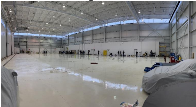
Indoor doesn't get any better than this!