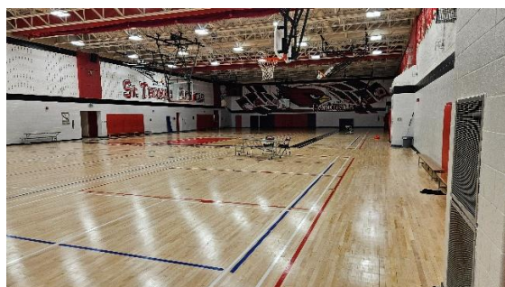
A huge space for indoor flying!