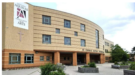
Saint Thomas Aquinas Secondary School