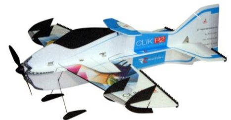
33" EPP Clik R2 "SUPER-LITE" →