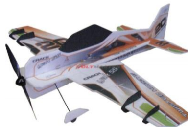
← 32" Crack Yak 55

Twisted Hobbies is a good place to start ( https://twistedhobbys.com/ ) or hurry to your local hobby shop! The 32" Crack Yak is a great indoor plane or try the super light Clik R2 for amazing mind-boggling aerobatics.