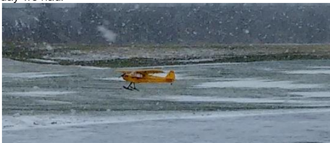
Neither rain, sleet nor snow can keep a good Cub down.

New Year's Day was a challenge due to the poor conditions and wind but the guys who turned out had a good time and shared some stories and hot chocolate. In spite of the snow there were still a half dozen or so flyers who managed to get into the air and everybody went home with their aircraft in one piece. See the photo gallery below to get an idea of the kind of day we had.