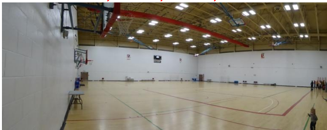
This panoramic view shows you how big our indoor space is!

11:00am to 1:00pm on the following Saturdays Jan 30, Feb 13, Feb 20, Mar 12