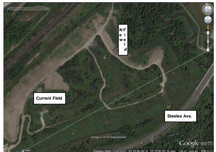
Google Earth view of approximate new site location

East side of the dump, overlooking the Humber valley. The runway would have a North South orientation.