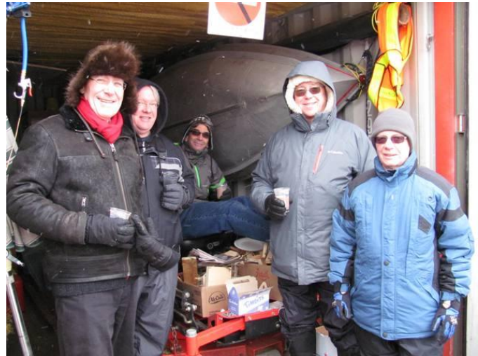
Hot chocolate is always a hit on New Year's Day.