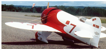
The 1932 Gee Bee R2

It's interesting to remember what cars actually looked like around the time of the Golden Age of Aviation that inspired the design of the Gee Bee Super Sportster (right). In comparison, the airplane was very advanced in aerodynamic design