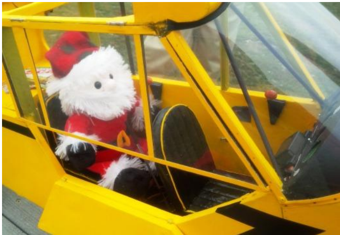
Santa Attends HVRCF New Year's Day Fun Fly