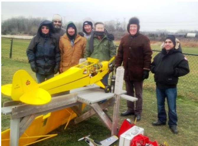
The guys gather around for a photo opportunity