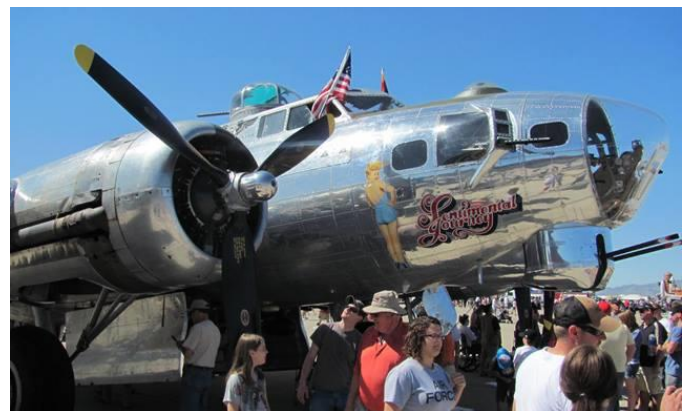
Beautifully Restored B-17 Flying Fortress