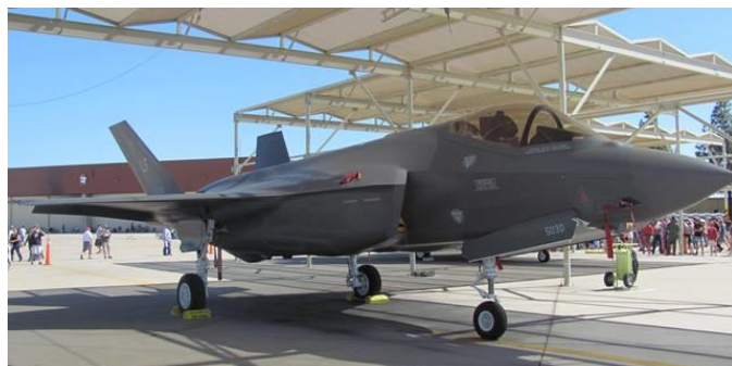
F-35 Lightning II Stealth Fighter Jet Up Close and Personal

The airshow was all over the news in Phoenix because the base received the first delivery of two Lockheed Martin F-35 stealth fighter jets. At $110 Million each, I thought it would be fun to see them. It turned out to be much more than I expected.