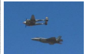
P-38 Lightning with F-16