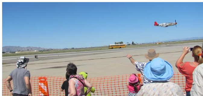
Historic P-51 Mustang Flyby

The air show, which had a theme of "Lightning in the Desert," included dozens of aircraft including aerobatics, the famous Thunderbirds formation flying (the same jet modeled by Graeme Mears) and historic flybys of a beautiful P-51 Mustang and a P-38 Lightning escorted by an F-16. The highlight of the day was a demonstration of the F-35 Lightning II stealth fighter.