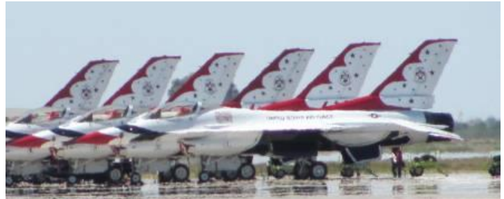
Thunderbirds lined up and ready to put on a show