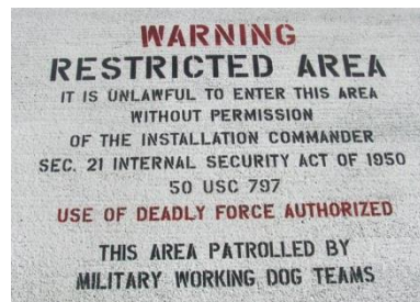
Watch where you walk!