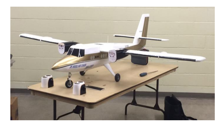
There was lots to see at the Feb meeting for those who attended. The fun never stops at Humber Valley!