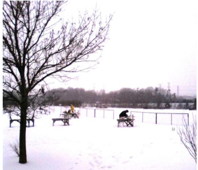
Baby it's cold outside!

Wasn't the best day weather-wise but a few brave souls showed up and braved the cold and the snow – it is February after all but as they say a bad day at the field is better than a good day at the office. Here are a few pics showing the cloudy cold conditions.