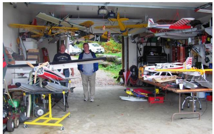
Lots of eye candy to be found in the Boat Airplane House

for being such gracious hosts. The flying site is ideal with direct access to the lake only 10 feet from the boathouse.