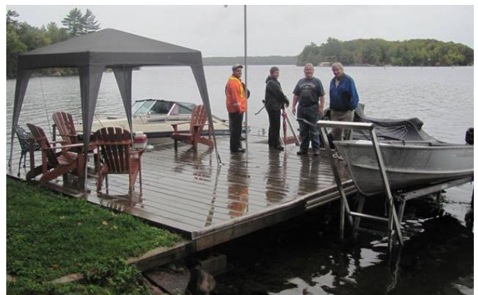
What's a little rain to determined Humber Valley Flyers?