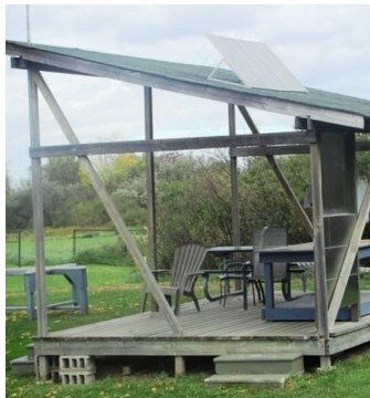
Solar panels mounted On the roof of the shelter.