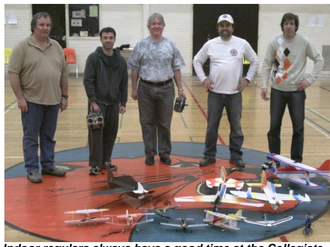
Indoor regulars always have a good time at the Collegiate

North Albion Collegiate Institute is located just south of the field at 2580 Kipling Avenue on the west side.