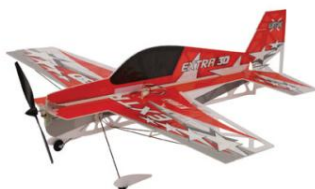
Pearl's New E-Flite Extra 3D