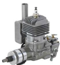
Gerry's New DLE-20