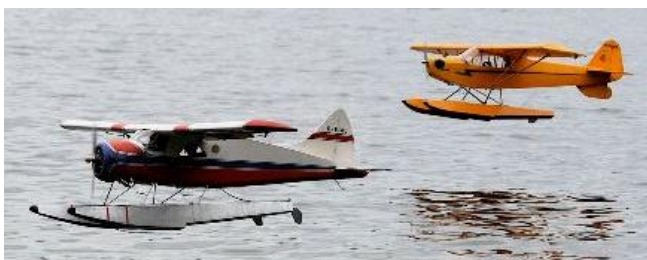
Above: Beautiful formation flying.

For float tips, check out the FAQ section of: www.foamfloats.com .