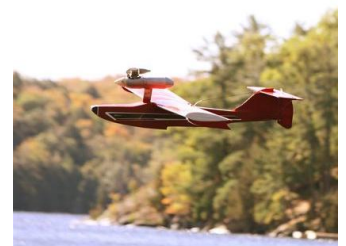
Rocco's Seamaster handles the wind