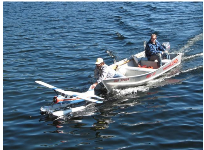
Don't try this at home. We are trained professionals.