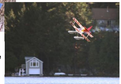
This pic is just to prove that Tom's crazy Ultimate on floats really files →