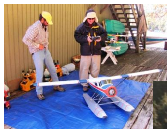
← Jon's big Beaver looks good on the dock