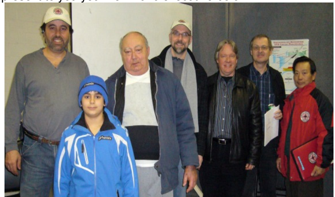
2010 Executive shown above (left to right)...