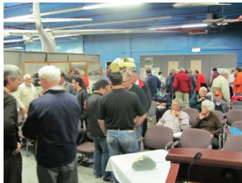
Standing room only at the May meeting.