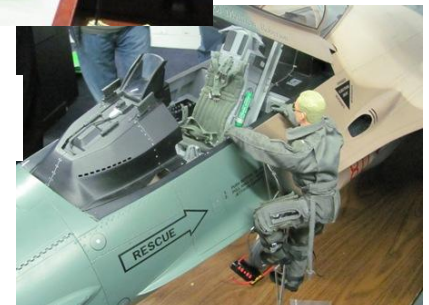
Incredible cockpit and pilot detail: →