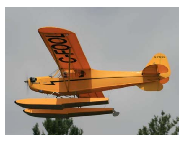
This really is Gary's Cub. The photo in the Sept/08 Flyer was a fake – It was actually a real Cub!