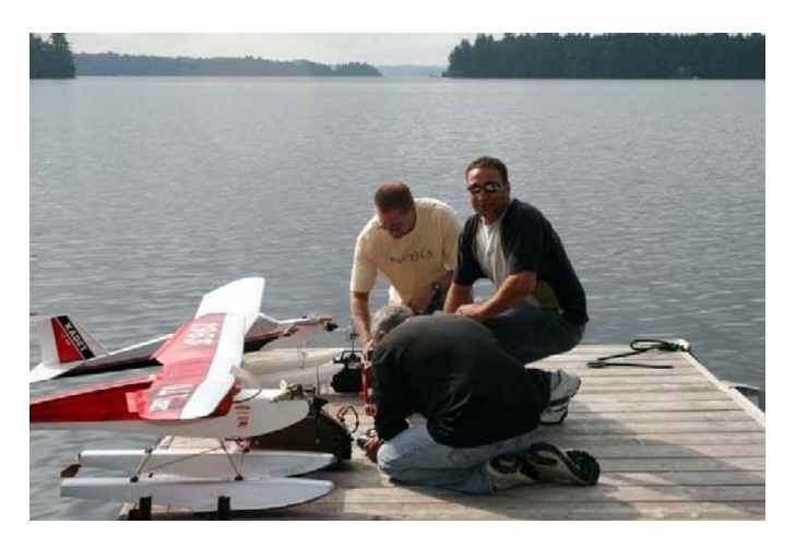
Getting things set up on the dock.