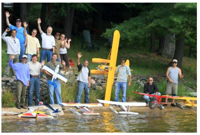
Does this look like fun or what?