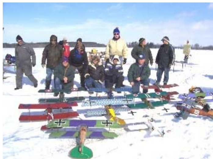
Looks like it was a great day for WW 1 Biplanes!

That's what we call complete air supremacy!