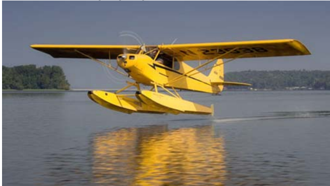
A beautiful Cub is about to touch down in smooth water.