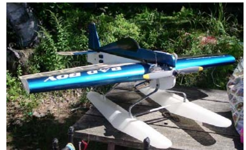
Tom's Bad Boy on floats might make for good "Show and Tell" material

Show & Tell: Got an interesting story to tell or a cool model to show off? Bring it in for 5 minutes of glory in front of your fellow members.