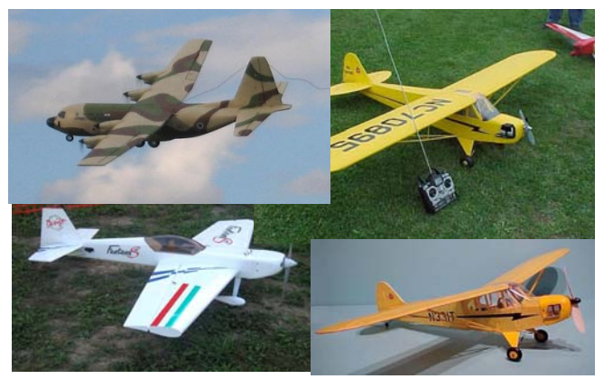
A small sample from Michael's hangar.

Michael is an accomplished builder and flyer. He enjoys the hobby as a sport flyer and builds all kinds of planes from tiny scale indoor models, to large scale and sport models. He is planning to bring a 3½ ounce scale Piper Cub (converted from a rubber-power kit), an award-winning 1/5 scale Sig Cub (an electric conversion), a simple yet easy to fly GWS C-130 Hercules (foam ARF - painted), a Hanger 9 Funtana (ARF electric conversion), and a few others.