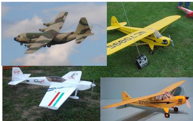
A small sample from Michael's hangar.

Michael is an accomplished builder and flyer. He enjoys the hobby as a sport flyer and builds all kinds of planes from tiny scale indoor models, to large scale and sport models. He is planning to bring a 3½ ounce scale Piper Cub (converted from a rubber-power kit), an award-winning 1/5 scale Sig Cub (an electric conversion), a simple yet easy to fly GWS C-130 Hercules (foam ARF - painted), a Hanger 9 Funtana (ARF electric conversion), and a few others.