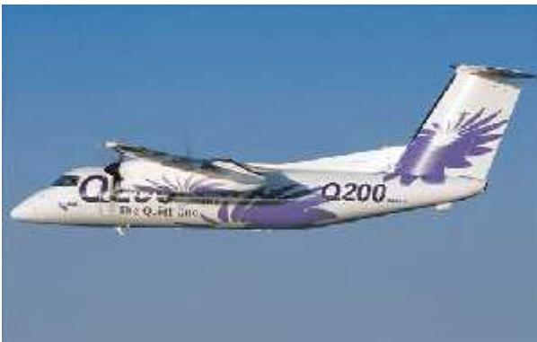
A beautiful De Havilland Dash-8 in flight.

As you know, this plant has manufactured such classics as the Beaver and the Otter and is currently producing the well known Dash series of turboprop commuter planes. This should be an extremely interesting tour.