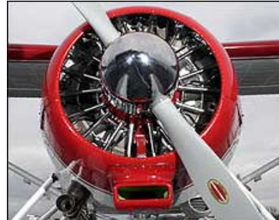
The business end of a mint-condition De Havilland Beaver.

We have arranged a tour of the DeHavilland plant for Sunday Feb 15, 10AM. As you know, this plant has manufactured such classics as the Beaver and the Otter and is currently