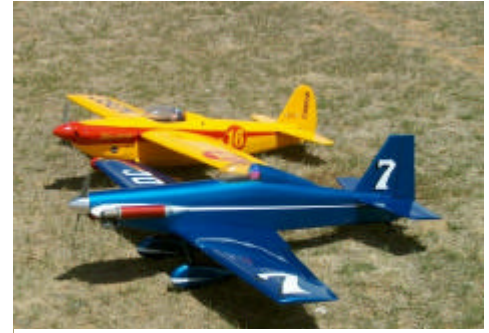
The Great Planes "Shoestring 16" (above) designed for Pylon Racing