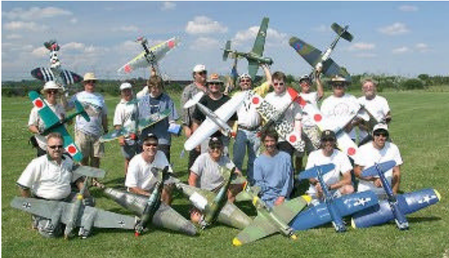
What a great turnout!

This year's "Death Valley Dogfight" was held at our club field on July 11 th , and was an unqualified success, with a record 17 pilots participating! The event was well sponsored with prizes from Radio Control Sports and Hobbies, and an ad in the MAAC magazine resulting in excellent spectator turnout! There were 20 to 30 spectators at any giving time throughout the day. Some came from as far as Wharton - a 3 ½ hour drive – just to watch the action!