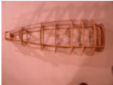
Fuselage Looks Like a Giant Bumble Bee