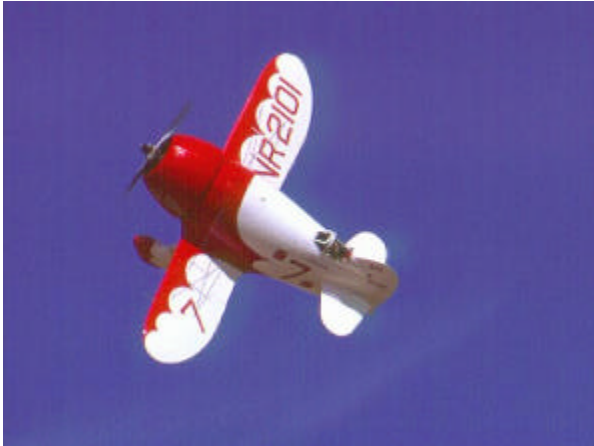
Can you name this plane and it's ill-fated pilot?

We are planning a special presentation for the March meeting on the Golden Age of Air Racing. Watch this space for upcoming details!