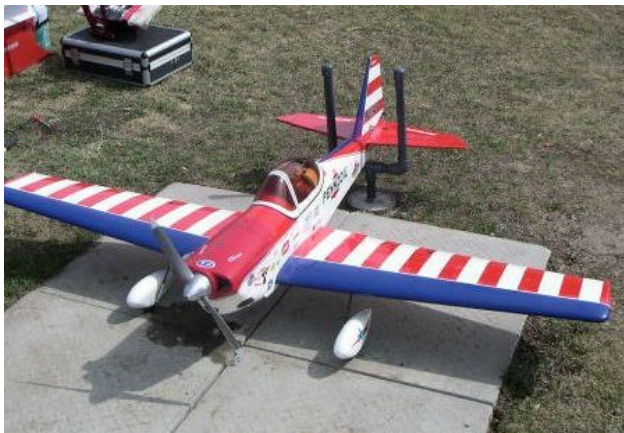
Joe Blume's Super Chipmunk enjoys the use of the new tail restraints.

During our field cleanup day, improvements were also made to the old pilot stations. They have been spaced further apart and improved with "U" shape tail restraints (see photo). All